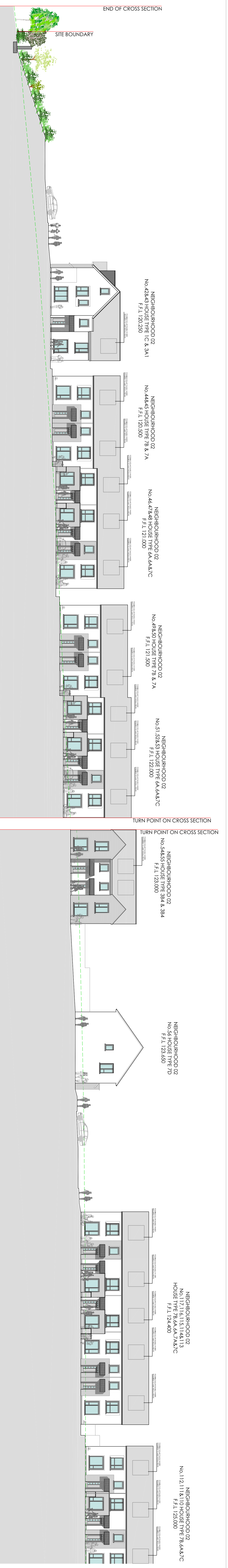
Section 1-1 Part 1 of 2 SCALE: 1:200 @ A0