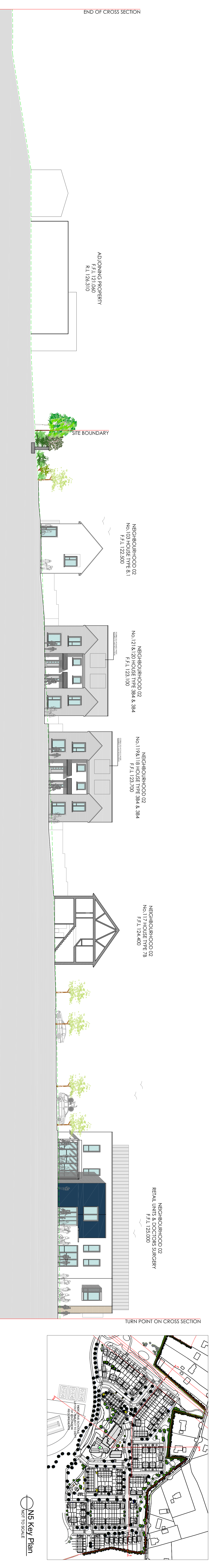
Section 2-2 Part 1 of 2 SCALE: 1:200 @ A0