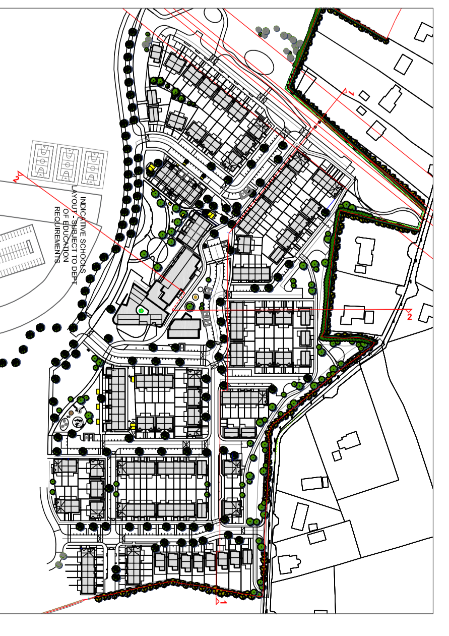
NS Key Plan NOT TO SCALE